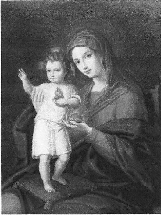
Irish Pallottines Mother of Divine Love Province